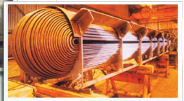
L.P. Heater under fabrication for 10mw power plant.