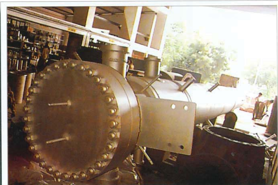
A special design H.P. Heater ready to be shipped to the 30mw Chhatisgarh Electricity co.

Mazda thorough understanding of these factors enhances its ability to communicate clearly with power design engineers. Mazda designs enable power engineers to anticipate maximum efficiency from